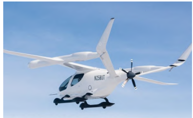
300 eCTOL model aircraft.